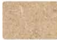
4669-60 NATURAL TIGRIS