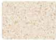
4143-60 NEUTRAL GLACE