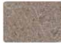
4674-60 EVENING TIGRIS