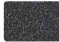
4623-60 GRAPHITE NEBULA